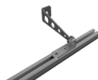
Long Bracket Code: FN8001