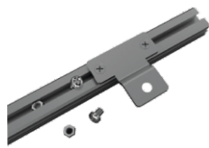
Fixed Bracket Code: FB7001