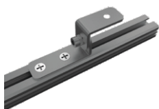
Adjustable Bracket Code: AB6001