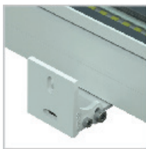
Wall Mounting Bracket Code: WB1001