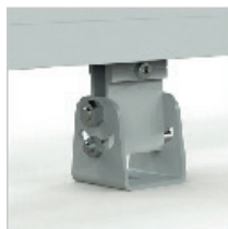
Ground Mounting Bracket Code: GB1001