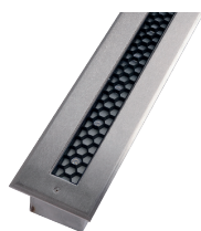
Honeycomb Louvre Code: HC3001