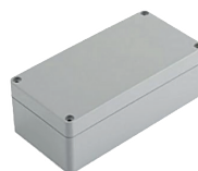
Fuse Box MT Code: FB1003