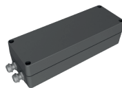
Fuse Box Thin Code: FB1001