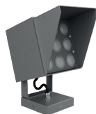
Glare Shield Code: GS9174