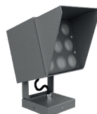
Glare Shield Code: GS9171