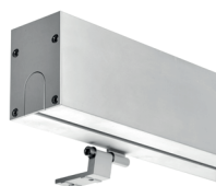
Rectangular Outer Housing Code: ROH1001