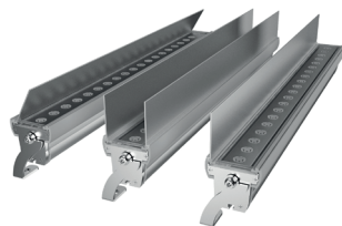
Glare Shield One Sided Code: GS2201 Two Sided Code: GS2202