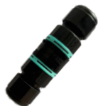
IP68 Plug Power Connector Set Code: CON1201