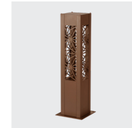
Available in Corten colour