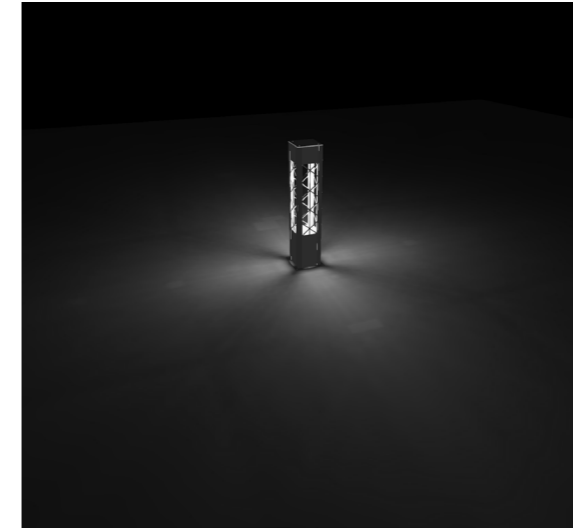
Rotational light distribution