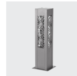
Available in Silver colour