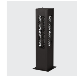
Available in Black colour