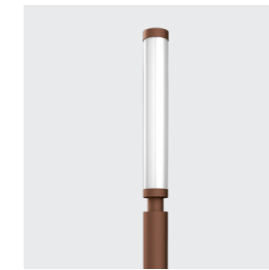
Available in Corten colour