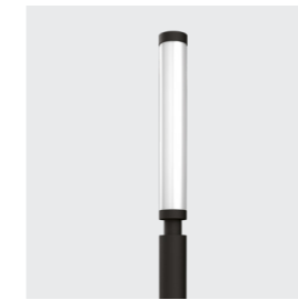
Available in Black colour