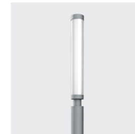
Available in Silver colour