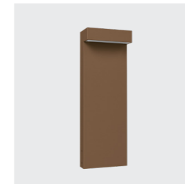
Available in Corten colour