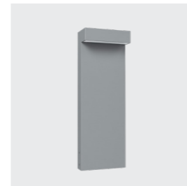
Available in Silver colour