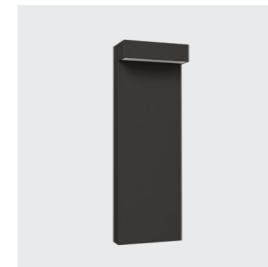
Available in Black colour