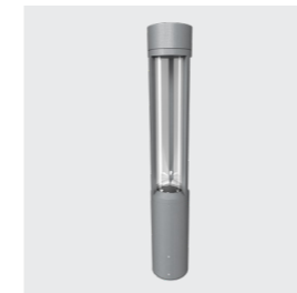
Available in Silver colour