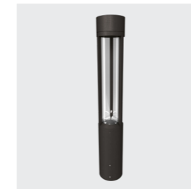
Available in Black colour