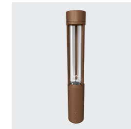
Available in Corten colour