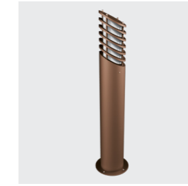
Available in Corten colour