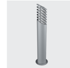
Available in Silver colour