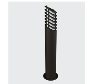
Available in Black colour