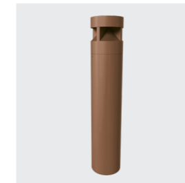
Available in Corten colour