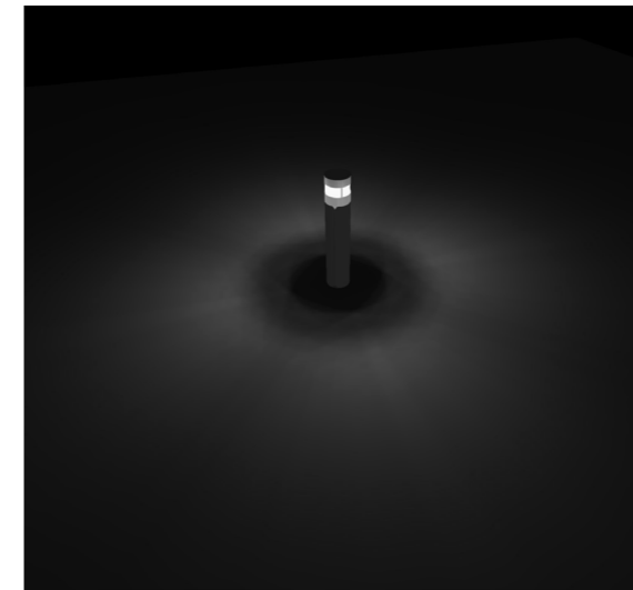
Rotational light distribution