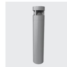
Available in Silver colour