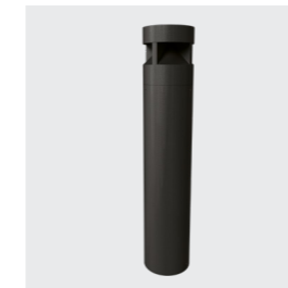
Available in Black colour