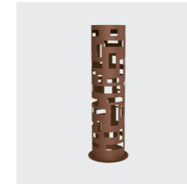
Available in Corten colour