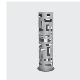
Available in Silver colour