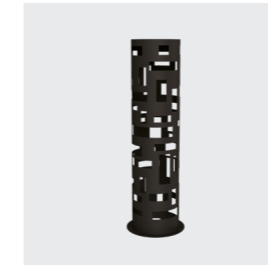
Available in Black colour