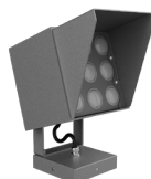
Glare Shield Code: GS9174