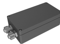
Fuse Box Large Code: FB1002