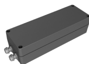
Fuse Box Thin Code: FB1001