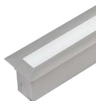
Aluminium Frame Code: AF5001