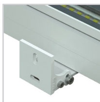
Wall Mounting Bracket Code: WB1001