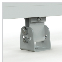
Ground Mounting Bracket Code: GB1001