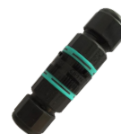
IP68 Plug Power Connector Set (Two pieces) Code: CON1202