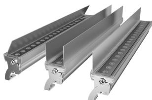
Glare Shield One Sided Code: GS2201 Two Sided Code: GS2202